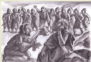
Doeg telling Dovid of the news