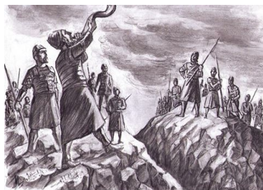
Yoav blowing the shofar