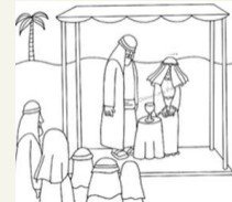
Avner marrying Ritzpa bas Aya

since Binyomin and the Zikenim are powerful and will get the others to follow. Avner went with 20 people to Chevron, Dovid welcomed Avner with a feast. At the feast reported Moshe ben Geira from the shevet of Yehuda. At the meal Avner proposed that he bring all the yidden to Dovid, Dovid agreed. .