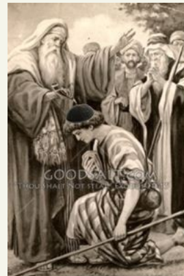
Shmuel anointing Dovid